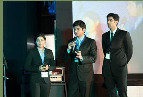
Deloitte Maverick Eastern Region Finals - XIMB