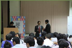
ET Young Leaders

Xpressions 2014, the annual fest of XIMB, bagged the Youth Inc Festival Awards